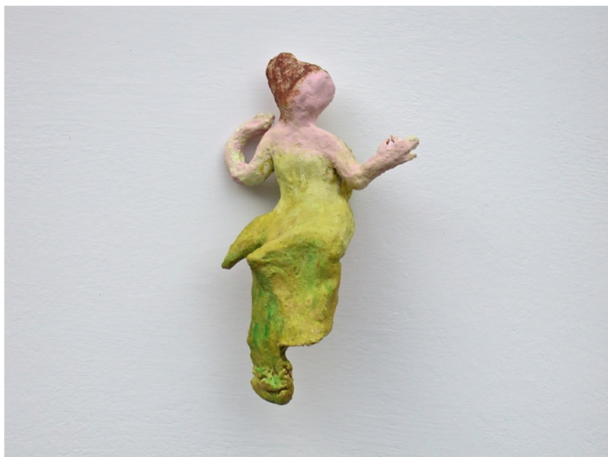
Jackie Shatz Spring, 2017 Ceramic and paint 10 x 7 x 3"