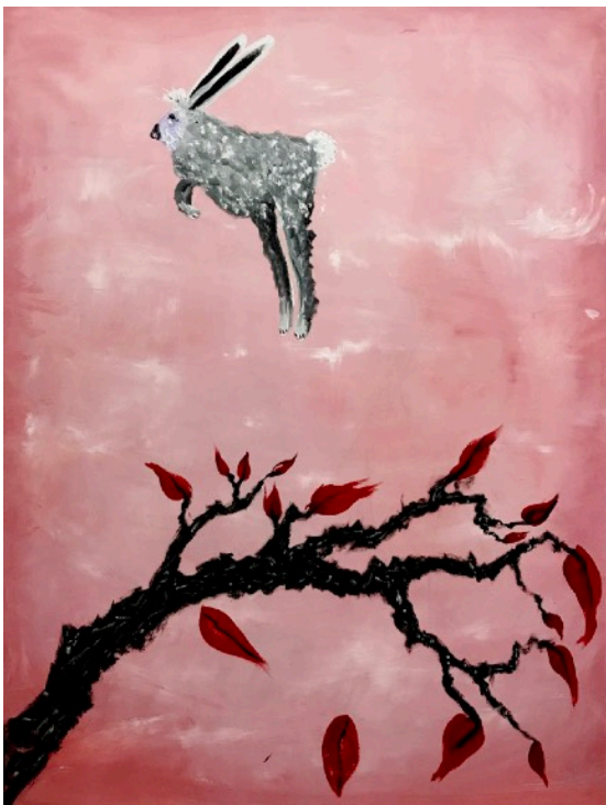
Mary DeVincentis Bunny Hopper , 2019 Oil on canvas 48 x 36"

Masks are optional for vaccinated visitors.