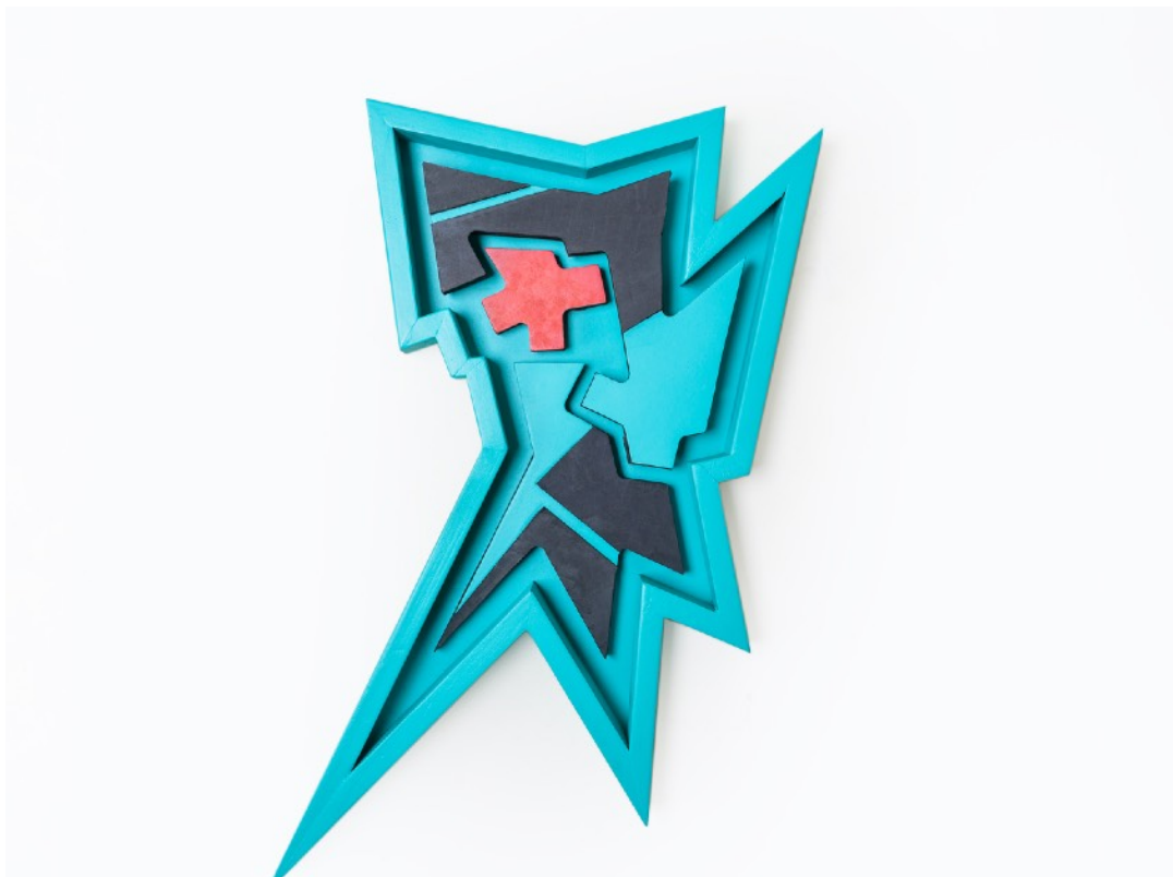
Nygel Jones, Invasion Shape , mixed media, 25 x 15 x 3"