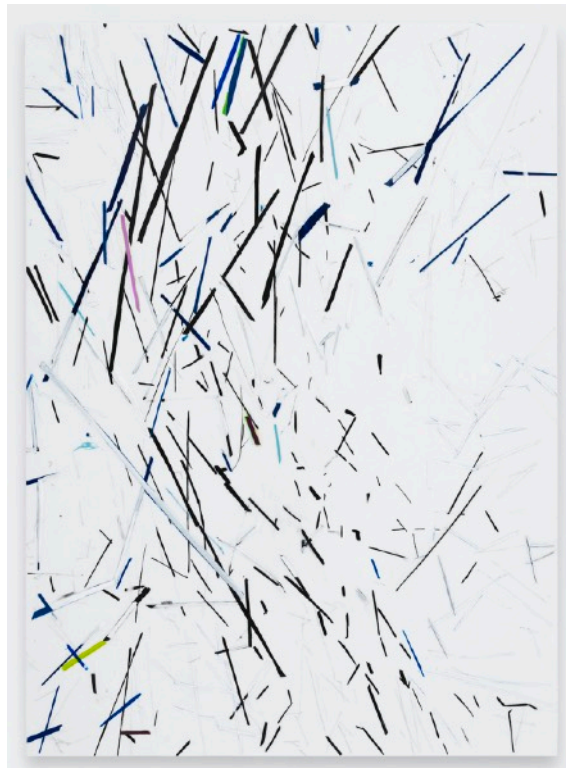
Eve Aschheim, Blitz , mixed media on mylar, 18 x 13"

Regular gallery hours: Wednesday to Saturday 11am - 6pm, Sunday 11am- 4pm or by appointment.