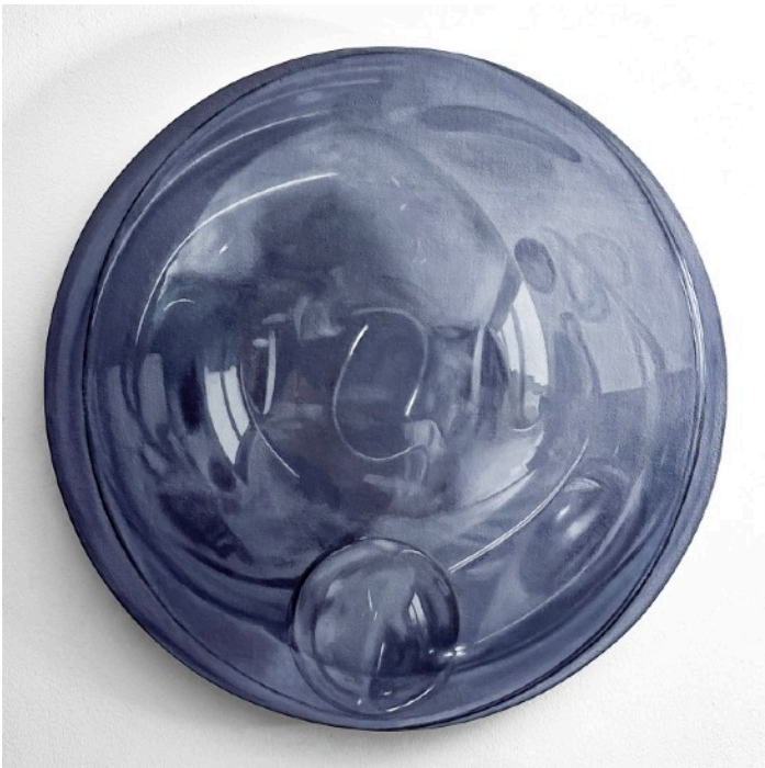
Kevin Cobb Signum Mundi , 2023 Oil on canvas 20 x 20in