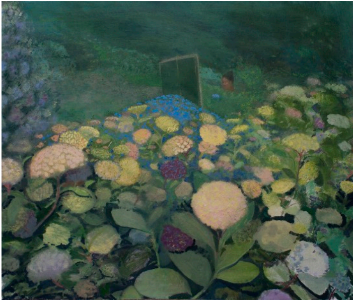
Abigail Dudley (b.1996) Mountain Flowers , 2022 Oil on linen 38 x 32in