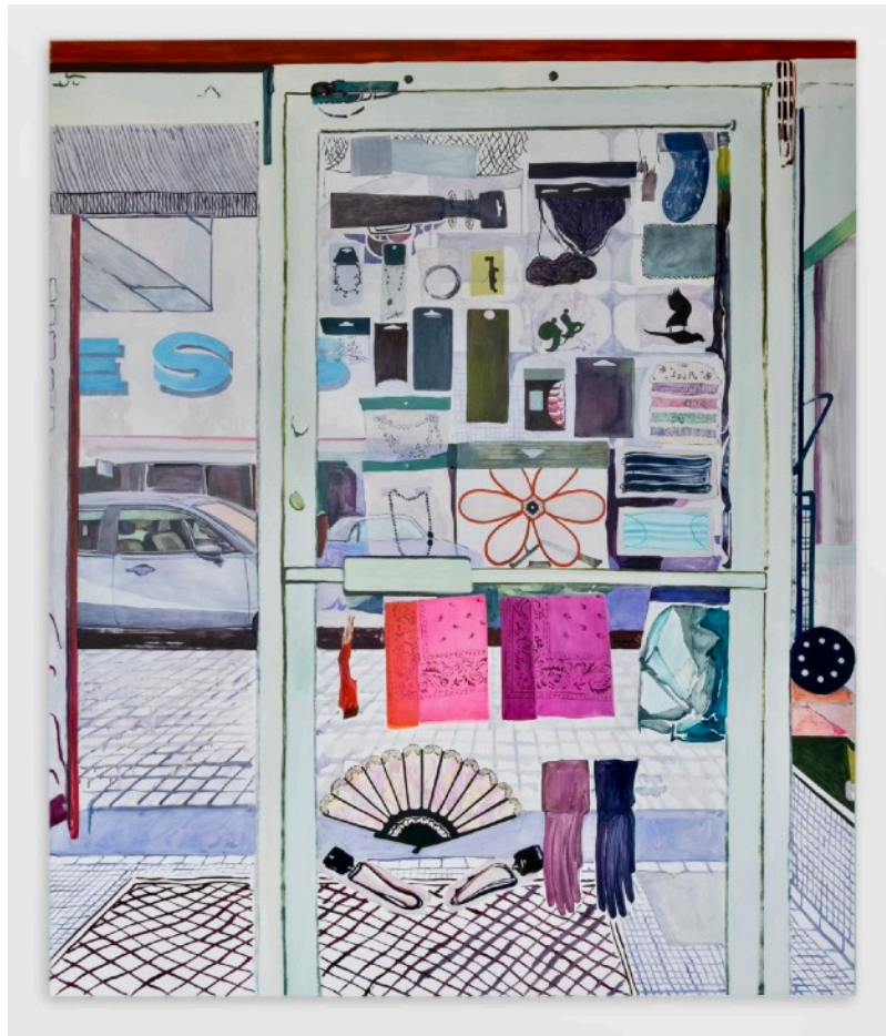
Lizzie Zelter General Haus , 2023 oil on canvas 72 x 60 in