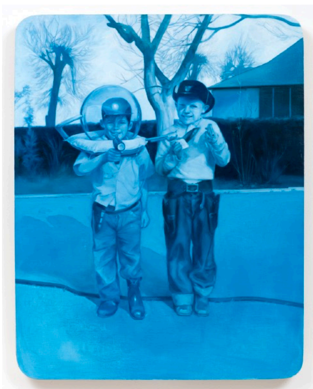
Meghan Murray (b. 1994) Atom Rockets Declared Ready For Combat Use (Dec. 21, 1952) , 2022 Oil on linen over panel