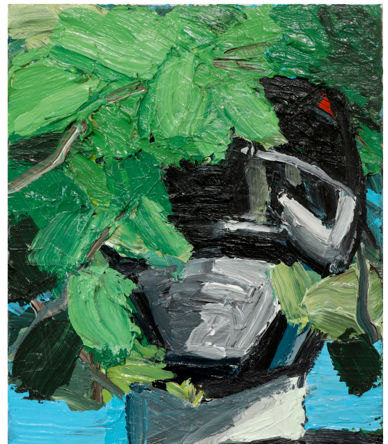
Jordan McGirk (b. 1987) The Middle of Somewhere Acrylic on canvas 12 x 10 in