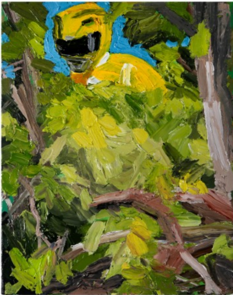
Jordan McGirk (b. 1987) A Course of Branches Acrylic on canvas 14 x 10 in

For press inquiries, images, or additional information, please contact LaiSun Keane at laisun@laisunkeane.com or 978 495 6697.