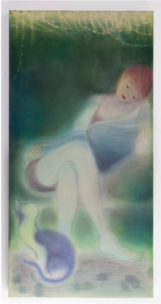
Xingzi Gu b. 1995 News Reader Oil and acrylic on canvas 48 x 24 in