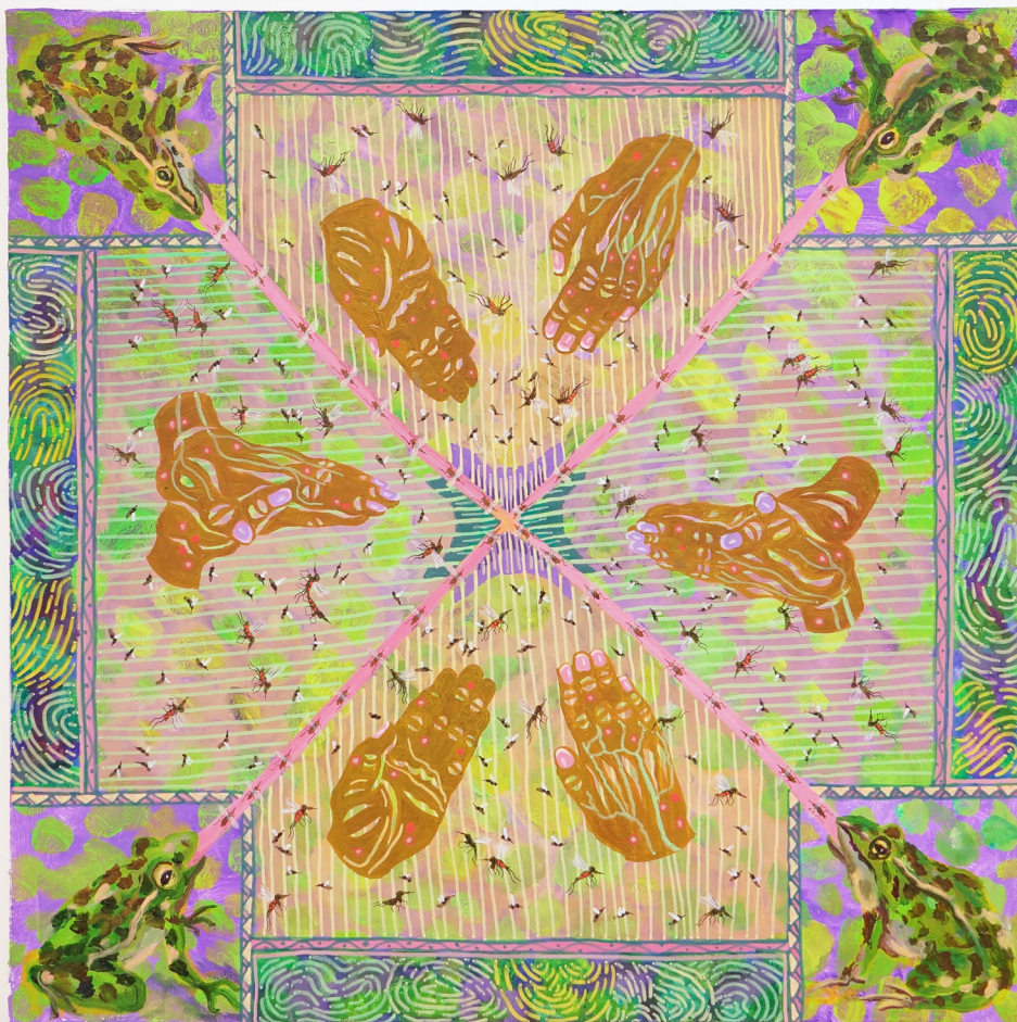
Maisie Luo Mosquitos Acrylic on canvas 24 x 24 in