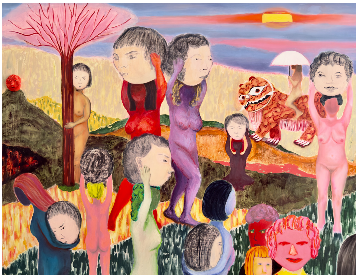
Eunha Kim The Carriers Oil on canvas 36 x 48 in