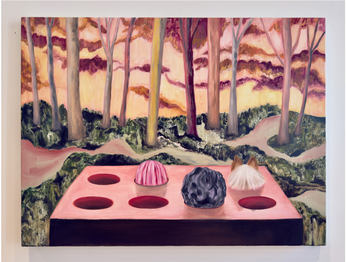
Eunha Kim Open Theatre II Oil on canvas 30 x 40 in