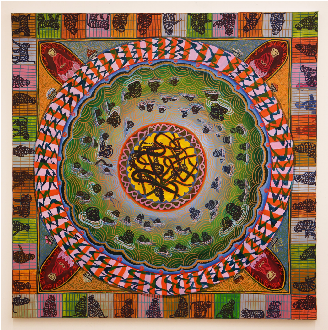
Maisie Luo Morgan Monkeys Acrylic on canvas 48 x 48 in