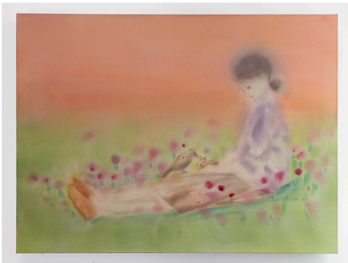
Xingzi Gu b. 1995 Parakeet Oil and acrylic on canvas 30 x 40 in