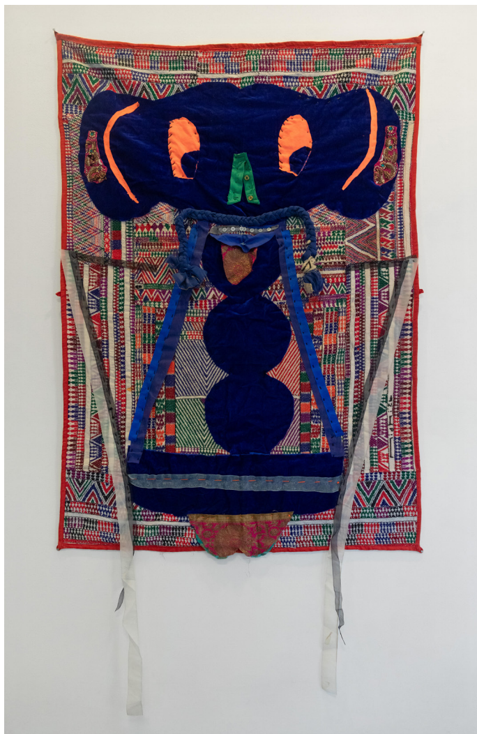
Nidhi Agarwal b. 1972 The Taxonomist Deity Fabric collage on Kuch embroidery 54 x 38 in