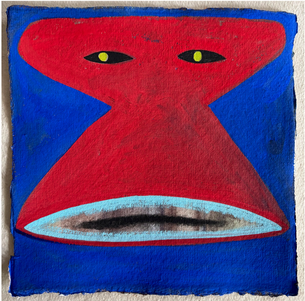
Nidhi Agarwal b. 1972 Mask of The Occult Goauche on deckled edge handmade paper 7.89 x 7.89 in