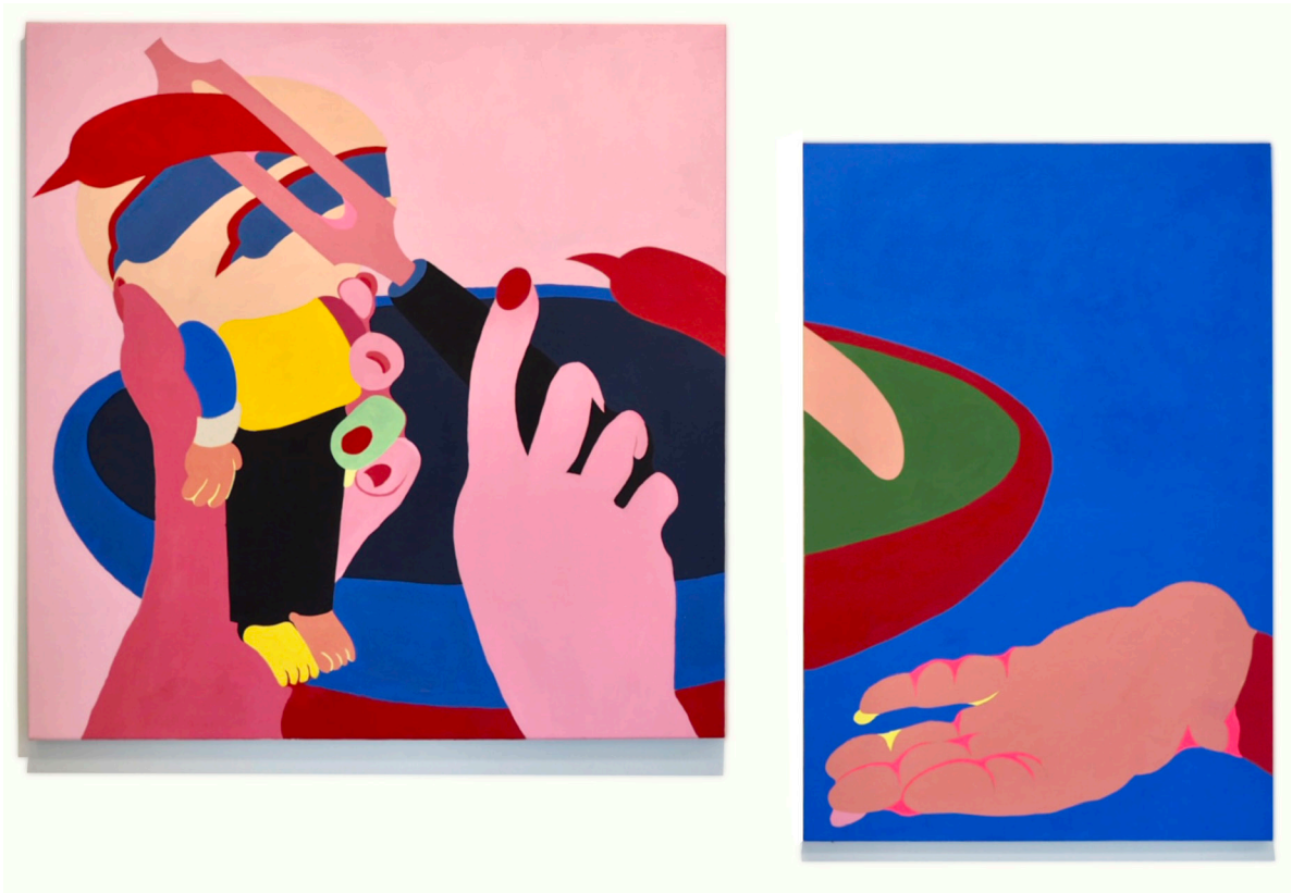
Nanako Kono b. 1999 Peeling off Potato's note Acrylic on canvas 41 x 64 in